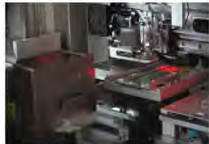
Epoxy Stamp System & Output Magazine Feeder