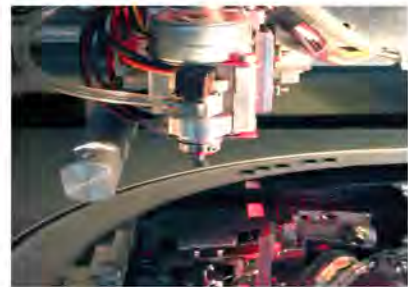
Rotary Pick & Place Head